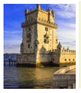
Region: Lisboa and around Hop a tram and explore Portugal's exciting capital Rossio square and train station Skip out to Sintra with its palaces and castles Beaches of Cascais & Aldeia do Meco Bar hop in Bairro Alto, dine in style in Chiado World Heritage Mosteiro dos Jéronimos – a Manueline delight