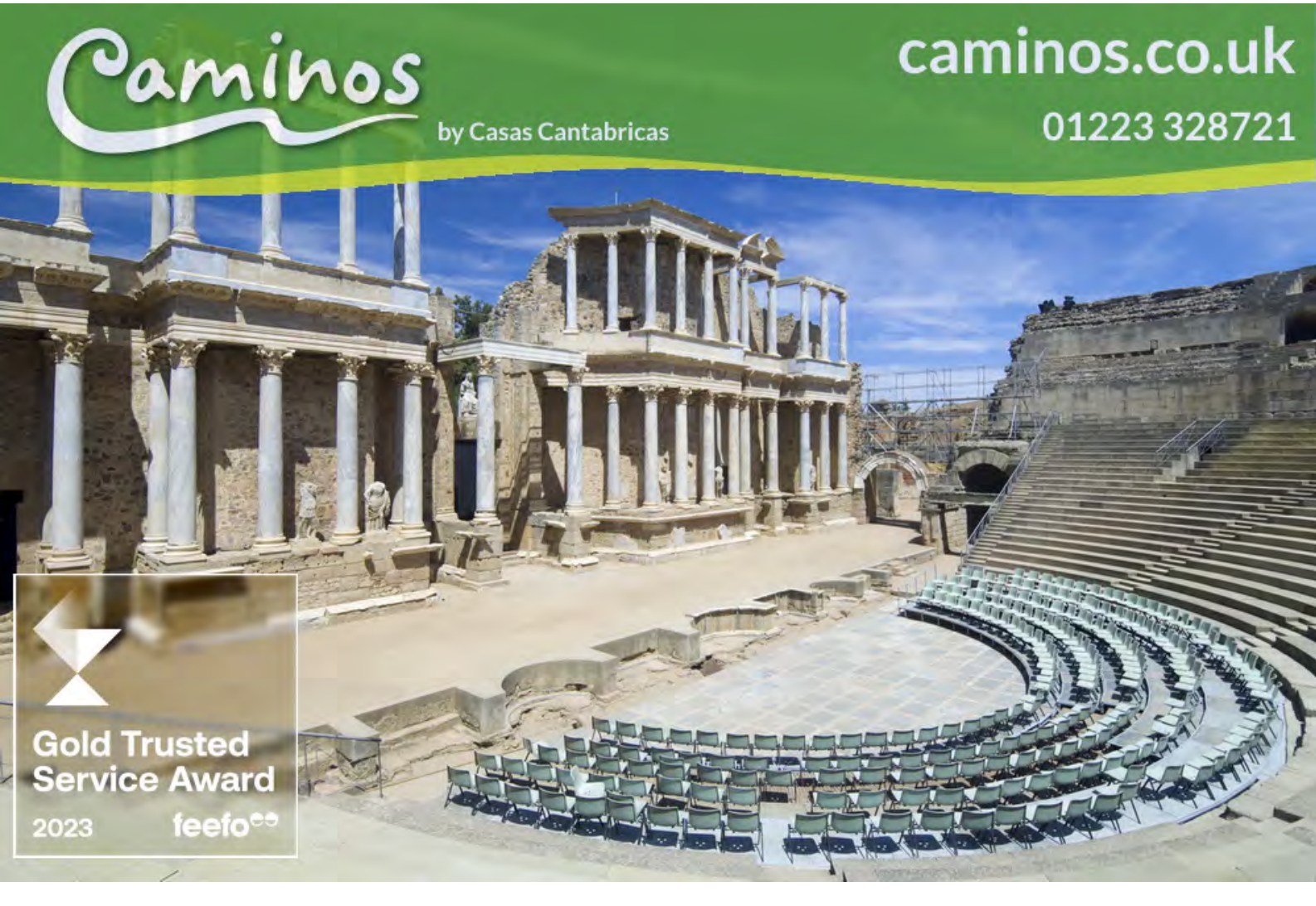
IC1 Via de la Plata